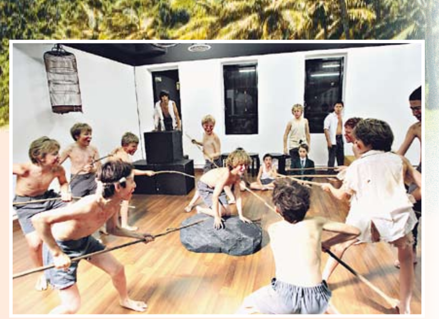
_{\approx} Kill the pig, spill the blood," the boys exclaim.

»The conch, which the boys use as a horn to call other survivors